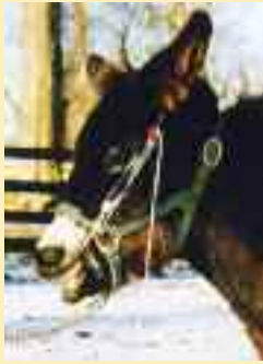
Works on donkeys too.

and he didn't get angry every time I tried to do something with him. He was learning, without being resentful. This made his training easier, without so much danger to me."