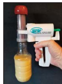
Shown with Large Cow Milker Inflation