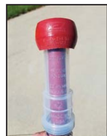
All three size Inflations fit into #2 Cylinder.