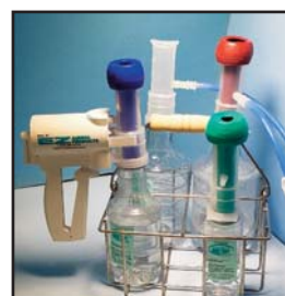
New updated parts for both Ez Milkers