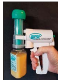
Show with Sheep & Goat Silicone Inflation & 8oz Bottle

The Udderly EZ milk and colostrum extraction cylinders come in one size #2. The Silicone Inflations are color coded and come in 3 sizes. They all fit into the hard plastic cylinder #2. Small to accommodate small or maiden mares, llamas, sheep, goat, cattle, etc. Medium for older medium size teats, and Large for the Big Teats on Cows, Camels, and Mares. Most all our kits are shipped with the Small and Medium size inflations, if an extra size is needed, please order at time of shipment. (it is a good idea to have all three on hand in case another size is needed.)