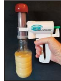
Shown with Large Cow Milker Inflation