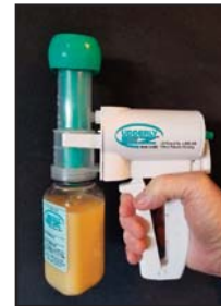
Show with Sheep & Goat Silicone Inflation & 8oz Bottle

The Udderly EZ milk and colostrum extraction cylinders come in one size #2. The Silicone Inflations are color coded and come in 3 sizes. They all fit into the hard plastic cylinder #2. Small to accommodate small or maiden mares, llamas, sheep, goat, cattle, etc. Medium for older medium size teats, and Large for the Big Teats on Cows, Camels, and Mares. Most all our kits are shipped with the Small and Medium size inflations, if an extra size is needed, please order at time of shipment. (it is a good idea to have all three on hand in case another size is needed.)