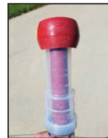
All three size Inflations fit into #2 Cylinder.