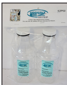
2 Pk 18 Oz Bottles #EZP02