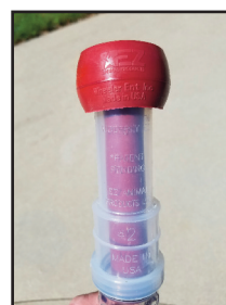
All three size Inflations fit into #2 Cylinder.