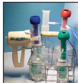
New updated parts for both Ez Milkers

Never use a microwave oven to thaw out frozen colostrum as it will destroy the antibodies. Place the colostrum bottle in a basin of warm water and allow to thaw slowly.