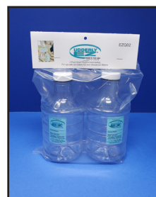
2 Pk Qt. Bottles #EZ002

Thank you for purchasing the UDDERLY EZ MILKER, the safest and most effective large domestic and exotic animal milk and colostrum collection device available. It can be used on horses, ponies, sheep, goats, llamas, alpacas, zebras, camels and cows. Udderly EZ is also the most efficient hand operated milking product on the market today. This patented vacuum pump is manufactured only with highest quality engineered plastics and is assembled under the strict government quality control standards for medical devices. All bottles have a FDA Guarantee for Copolyester Clear Containers. All bottles manufactured expressly to the specifications for use on the Udderly EZ Milker. They are made of clear Copolyester and comply with the compositional and inherent viscosity requirements of existing U.S. FDA regulations at 21 CFR 177.1315, for all foods.