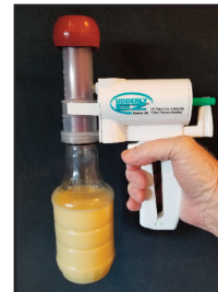
Shown with Large Cow Milker Inflation