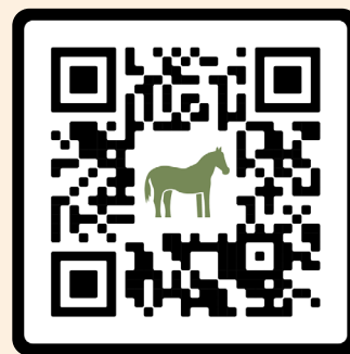
Equine Product Videos/Instructions

Visit our website for online live videos youtube.com/udderlyez1 Toll Free: 1-800-287-4791 Phone: 859-368-9509 info@udderlyez.com www.udderlyez.com Cell: 507-213-2126