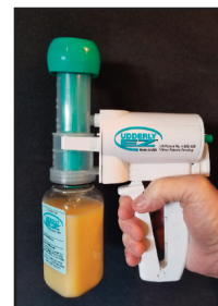
Show with Sheep & Goat Silicone Inflation & 8oz Bottle