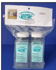
8 Oz Colostrum Bottles #EZ804

Specially designed clear plastic see-through 8 oz., 18 oz. or 1 quart colostrum collection bottles with rubber O-ring on top to assure vacuum when attached to the Udderly EZ Milker. Cap has leak proof liner seal. Ideal for freezing colostrum and storing for future use or to transfer colostrum to a nursing bottle for immediate use.