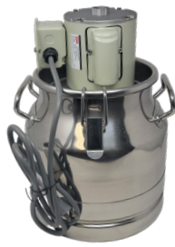
2.5 Gallon Butter Churn