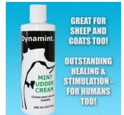
Dynamint Udder Cream

To contact us by mail: 1301 9th Ave North, Humboldt, IA 50548 or by phone (listed below) for your FREE CATALOG