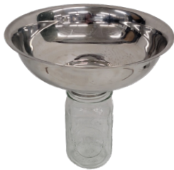
Medium Strainer Includes an extra mesh screen and fits wide-mouth canning jars.