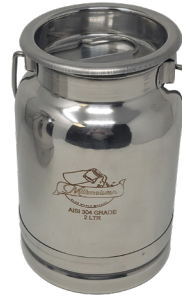
2 Ltr Tote