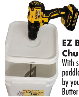
EZ Butter Churn With stainless paddle operated by your own drill. Butter in 9 minutes!