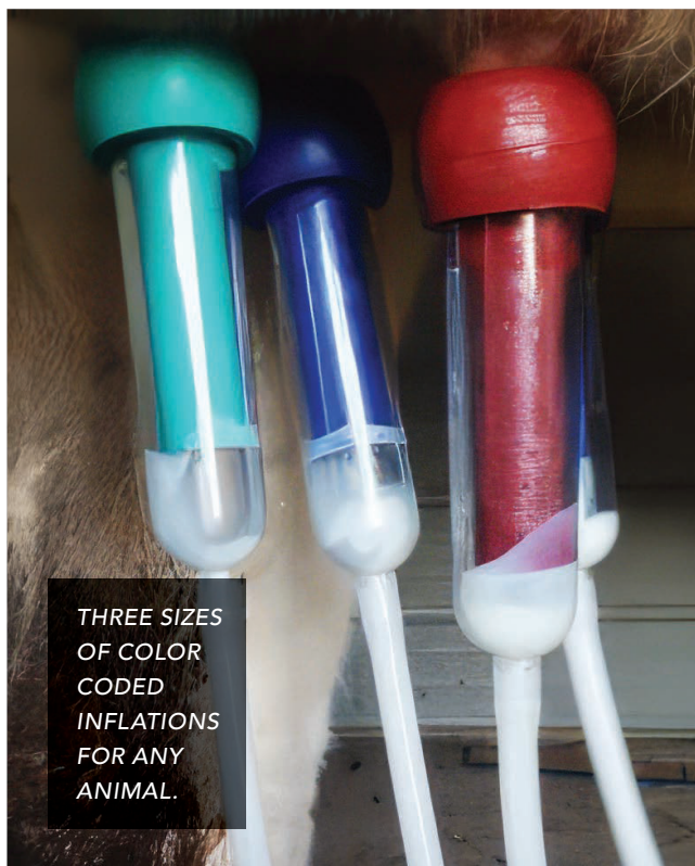
THREE SIZES OF COLOR CODED INFLATIONS FOR ANY ANIMAL.

But there was still one problem that nagged at many small dairy operators. Cleaning the milking systems and tanks effectively remained too much of a chore. Many folks were convinced that a more ambitiously scrubbing and disinfecting their equipment, it should sparkle more and look cleaner throughout.