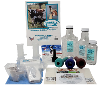
Udderly EZ Animal Milker