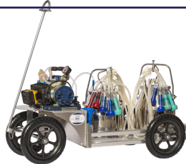
Ultimate EZ Milking System Single or Double Cart Available