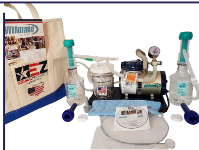
Ultimate EZ Bottle Milker