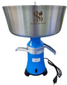
Slavic Beauty Cream Separators