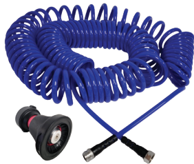
New EZ Power Wash Nozzle