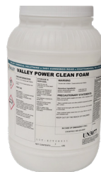
Power Clean Dairy Wash