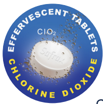
CL02 Chlorine Dioxide Effervescent Tablets