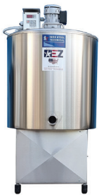
EZ Milk Coolers 15-, 30-, 60-, 90-, or 115-gallon capacity